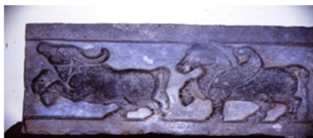
Fig. 4. Winged horse, Karnataka, India (www.commonswikimedia.org)

In India we get depiction of winged horse on one of the reliefs of the balustrade of stūpa at Sanchi and Amarāvati sculptures and also Karnataka (Fig. 4).