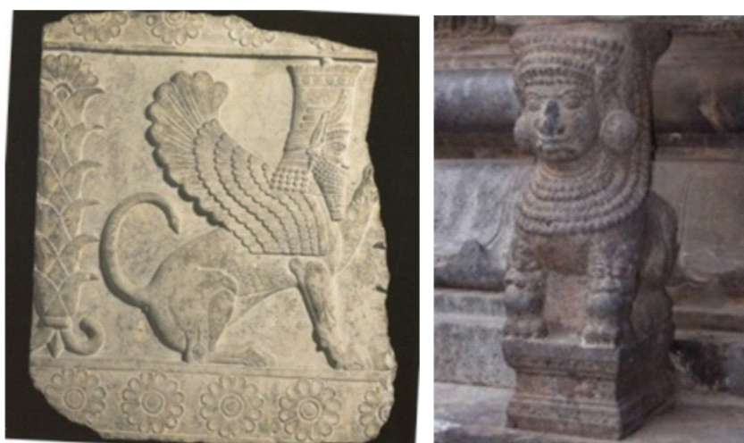
Fig. 7. Left: a seated bearded male sphinx facing right with raised left forepaw, Persepolis, Iran ( www.Britishmuseum.org ); Right: The type of sphinx without wings in an Indian temple ( http://www.sphinxofindia.rajadeekshithar.com )

The earliest sphinxes in India dating to the first century BCE up to the first and second century CE. These belong for the most part to the period of the Kuṣāna dynasty and follow the style of Gandhāra art. Examples have been found in the sculptures of Sanchi, Amarāvati, Barhūt and Mathura. A male with a lion body and wings and a female with a lion body and wings occur each