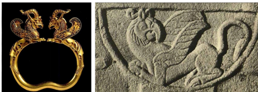
Fig. 5. Left: gold armband, Achaemenid period, 5-4 th century BCE ( http://www.britishmuseum.org ); Right: griffin at the stūpa of Sanchi, second half of 2nd century BCE (Kramrisch,1954, pic13)

The Elamite king Shilhak-Inshushinak rebuilt a great temple at Susa which was dedicated to Inshushinak, the great god of the Susa. On the panels of molded bricks which were used to decorate the facade of the monument, the figure of the bull-man has been shown wearing a tiara with several tiers of horns that protecting a palm tree alternates with a Lama goddess (Fig 6).