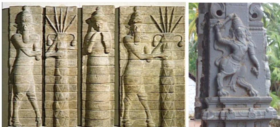
Fig. 6. Left: panels of molded bricks Susa, Iran ( www.louvre.fr ) ; Right: bull- man in ancient Indian temple ( http://www.sphinxofindia.rajadeekshithar.com )