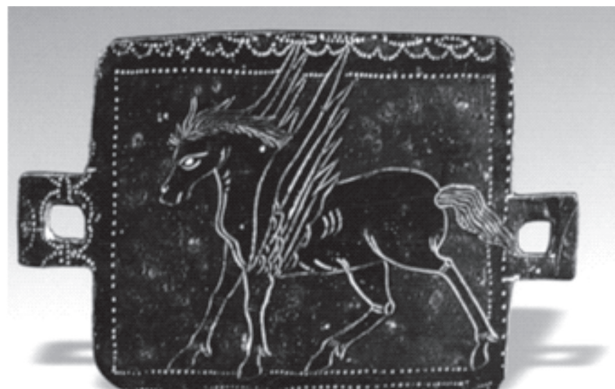
Fig. 3. Left: Winged-horse, Tepe- Sialk of Kashan , about 9 or 10 century BCE, National Museum of Iran; Right: a bronze plate of Parthian era, Masjed Soleymān, Khūzestān, Iran

the primeval ox a mythical creature out of whose blood had first sprouted the useful plants. Most interesting, however, is the origin of this particular version of the beast, for it bears witness to international exchange: it came from the Indus Valley (Pope, 1945, 8).