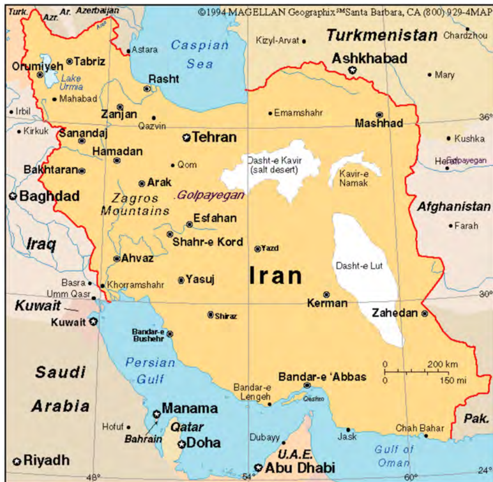
Fig. 1. Map of Iran; adopted from: http://www.iranologie.com/iran/iran2.html (University of Michigan)

from the circumstances cited below. Nevertheless, that is also the best time to view with one's naked eyes, subject to the conditions on ground.