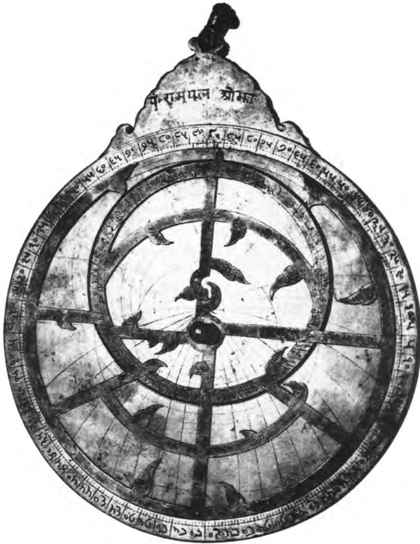
Fig 1. Sanskrit University Astrolabe; front view with the star map; below the perforated star map can be seen the plate with ecliptic coordinates

well. The kursī is cast in one piece with the mater and the upraised rim called the limb. The front and back of the kursī are plain without any surface decoration. In Mughal astrolabes, the kursī is generally pierced, but there are a number of cases where it is solid but lobed and scalloped like this one. 14