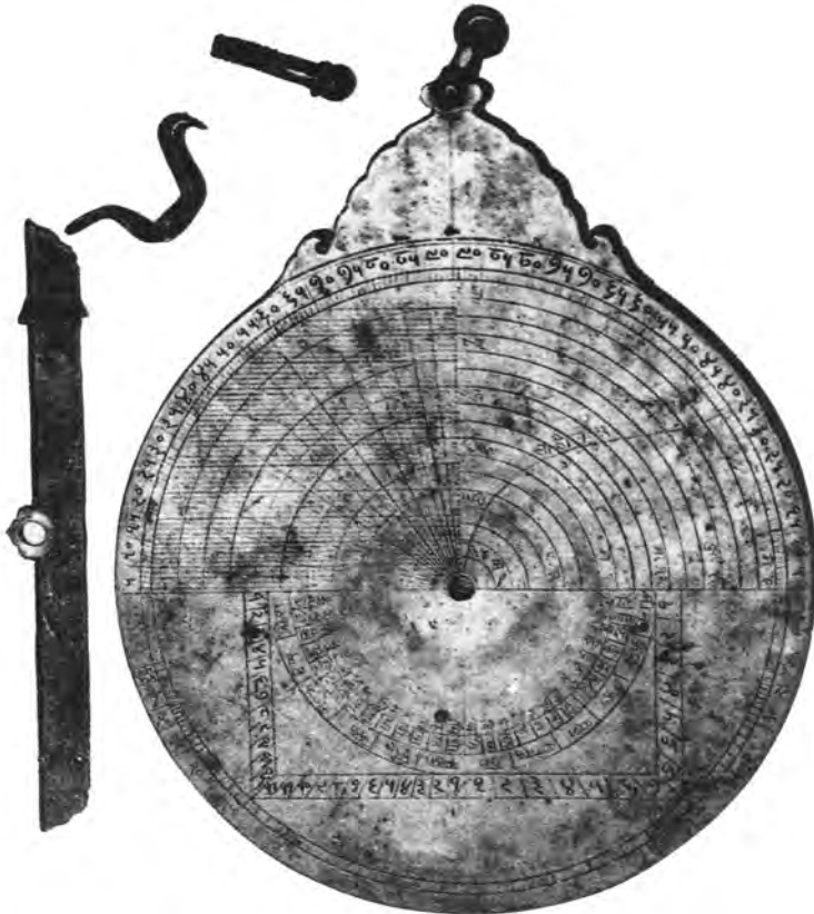
Fig 2. Sanskrit University Astrolabe; back view; with the alidade, nut and pin

2.3 The back of the astrolabe is divided into four quadrants by the vertical and horizontal diameters (see Fig. 2). The edge of the upper two quadrants is calibrated as in the front; i.e. the inner ring is divided into 90 degrees each and outer ring into 18 parts which