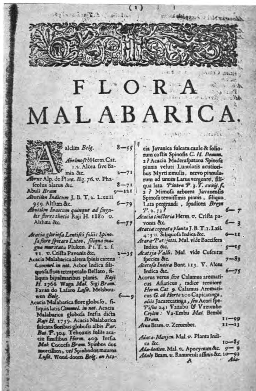
FIG. 2. First text page from Commelijn's Flora Malabarica showing polynomial phrase name of plants which are classified in alphabetical order.